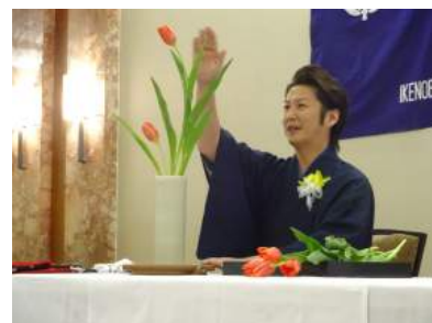
Tulip 2 shu-ike at the Demonstration, Los Angeles